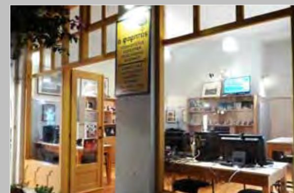
Foritos, Amorgos, Greece