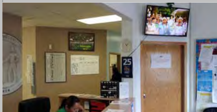
Onion Lake Cree Nation Radio Station, SK, Canada