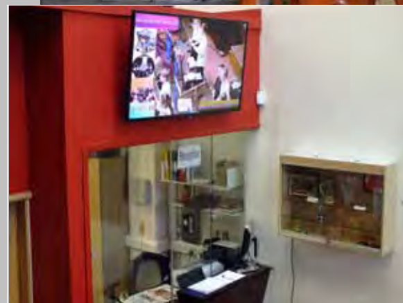
Albemarle Music Centre, Hull, UK