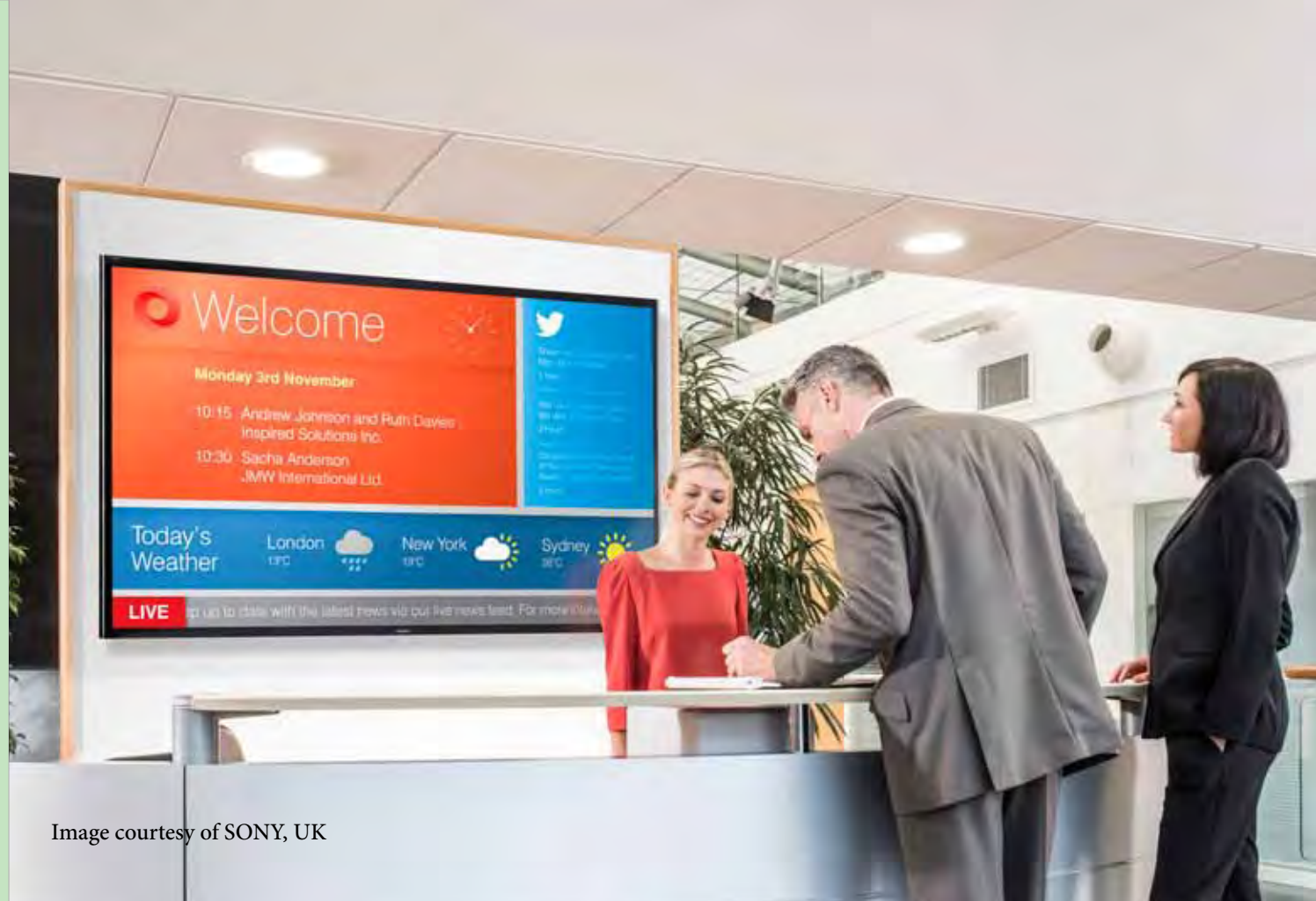
Image courtesy of SONY, UK