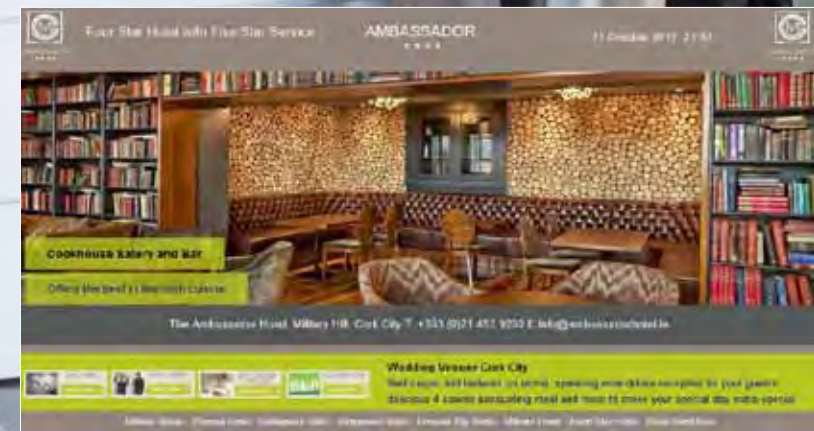
Presentation for the Ambassador Hotel Cork