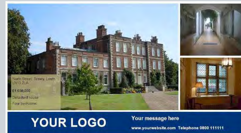
A Repeat Signage wizard template