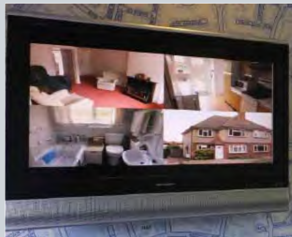
Repeat Signage at Hunters the Estate Agent