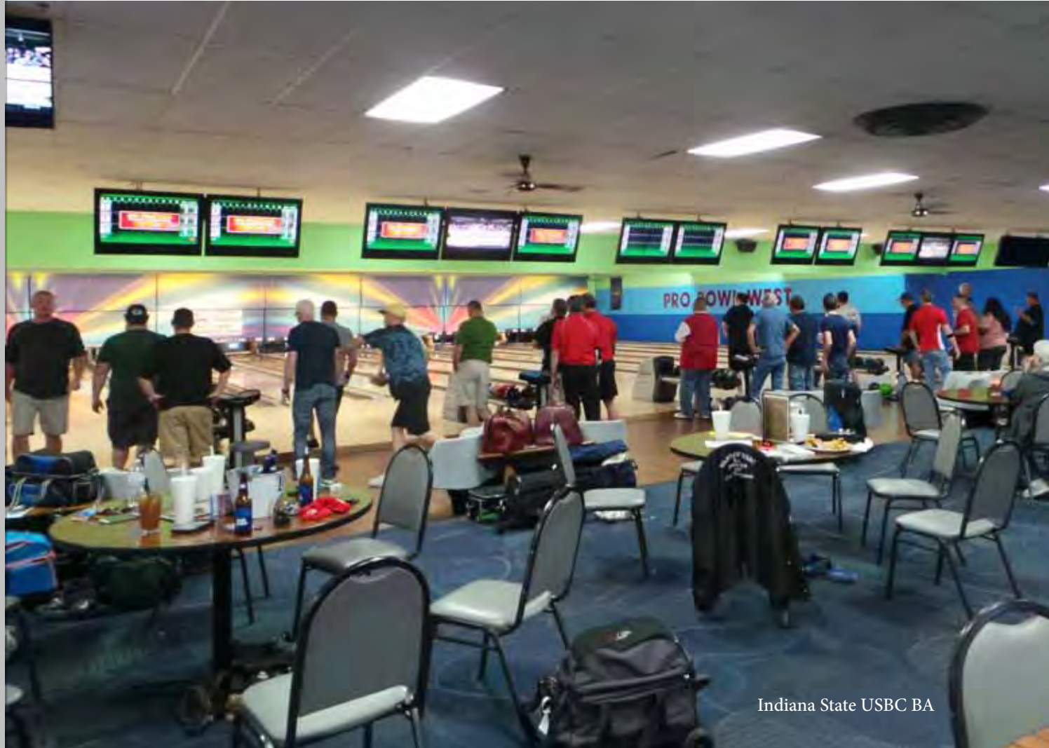
Indiana State USBC BA