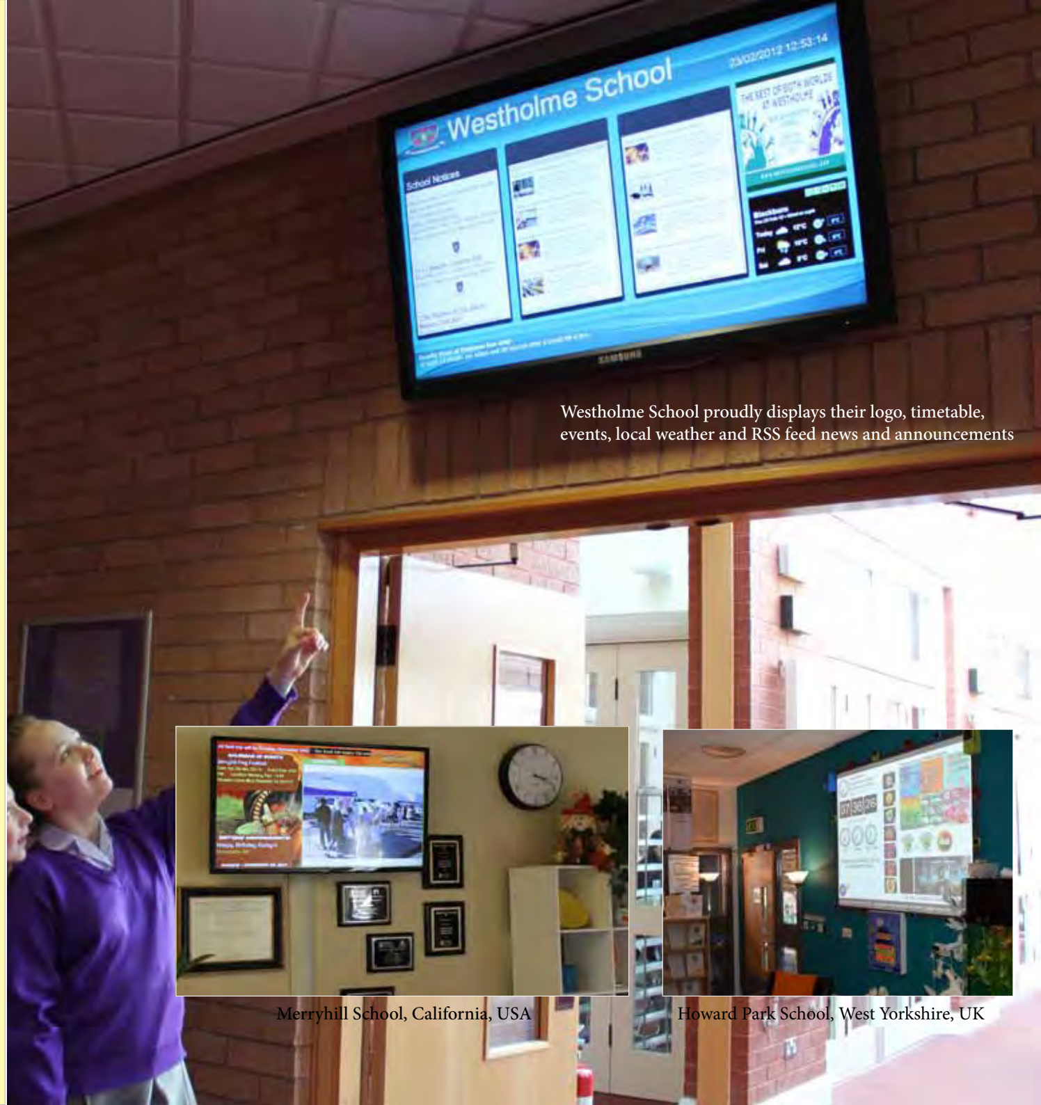
Westholme School proudly displays their logo, timetable, events, local weather and RSS feed news and announcements