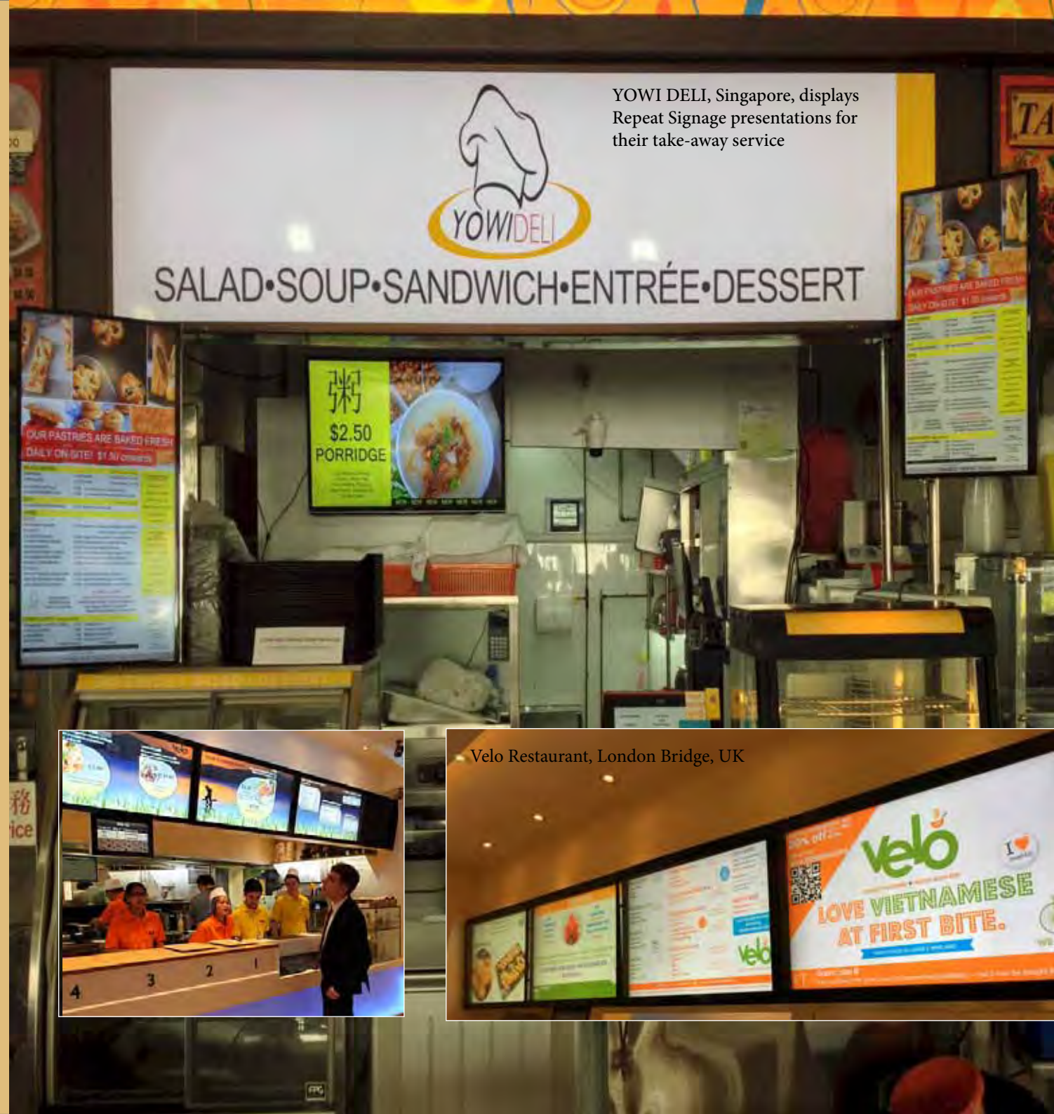
YOWI DELI, Singapore, displays Repeat Signage presentations for their take-away service