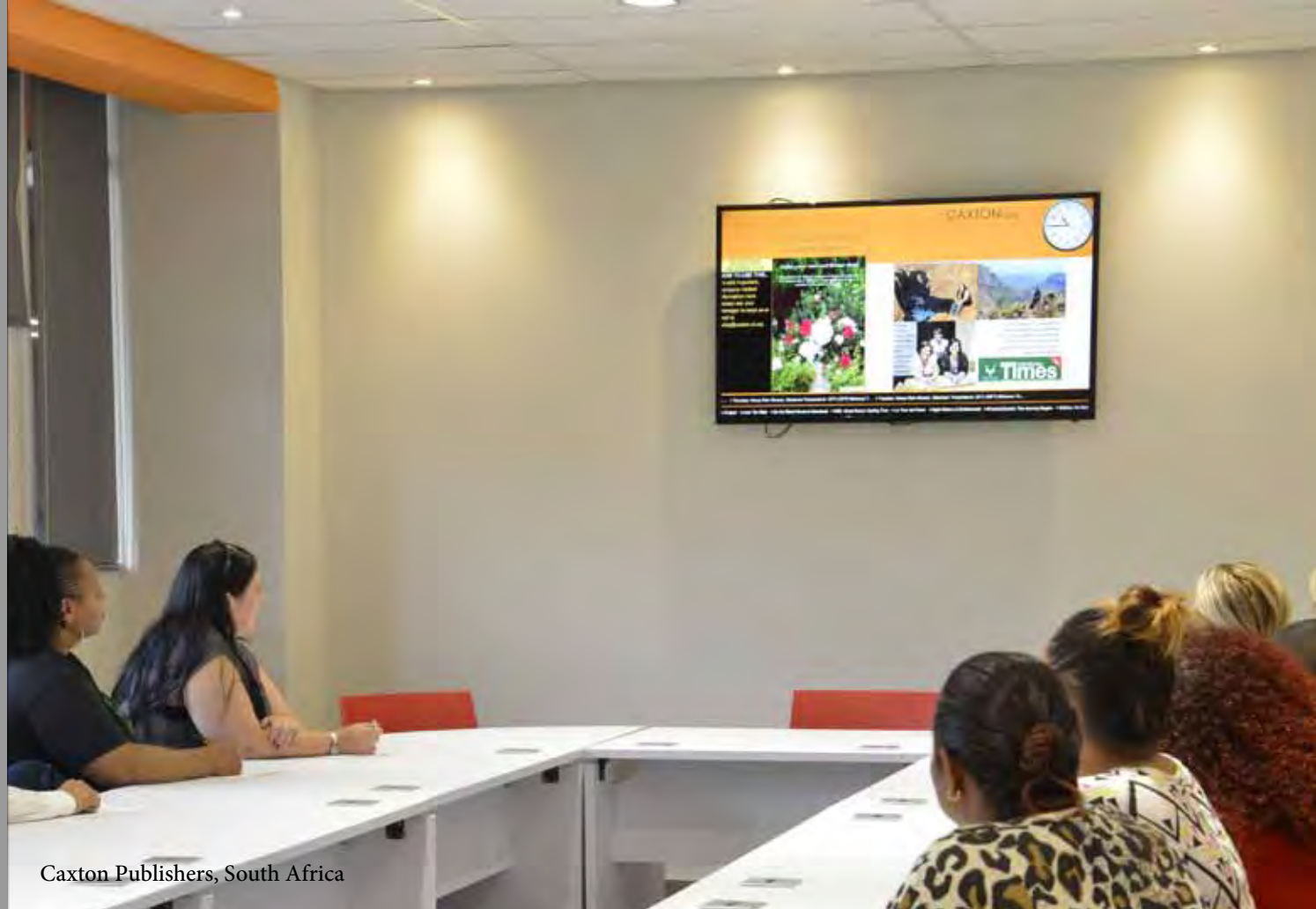
Caxton Publishers, South Africa

Igor Pestrikov, MODAEXPRESS USA Secaucus, New Jersey, USA.