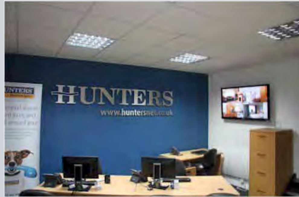
Repeat Signage at Hunters the Estate Agent

Kevin Hollinrake, Managing Director and Co-founder of Hunters the Estate Agent.