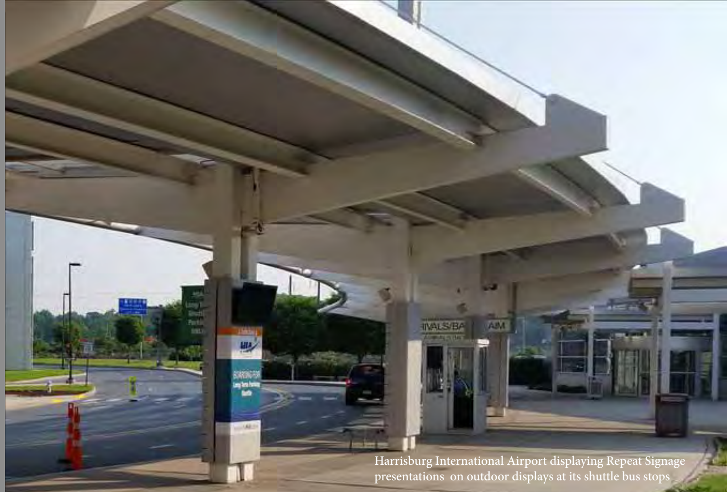
Harrisburg International Airport displaying Repeat Signage presentations on outdoor displays at its shuttle bus stops

“Support has been excellent and I have never been disappointed. Quick response times along with personal service rates this company very high in my personal satisfaction. I have, and will continue to recommend this company to others.”