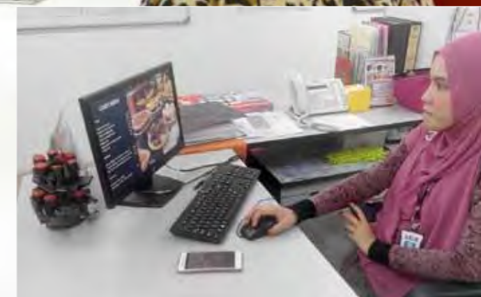
AZRB, Kuala Lumpur, Malaysia